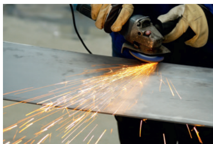
Triming of steel plates for welding